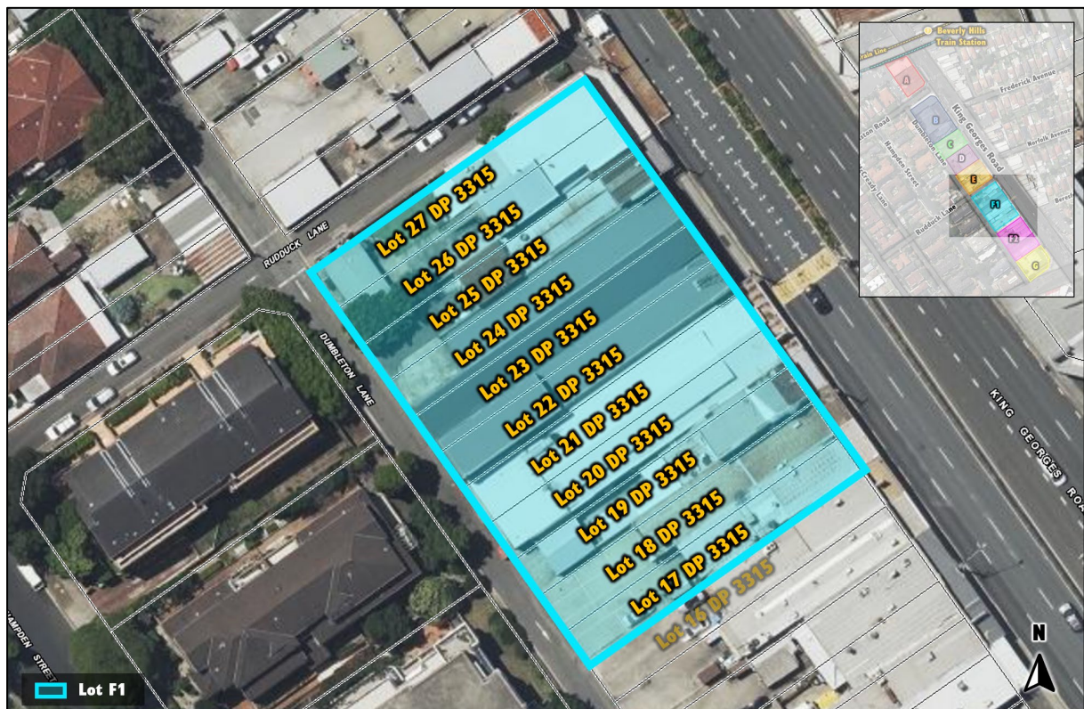
Figure 7: Group F1 Lots