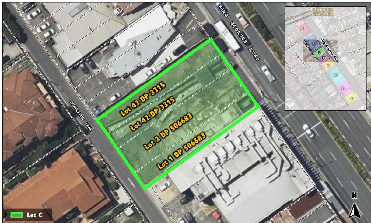
Figure 4: Group C Lots