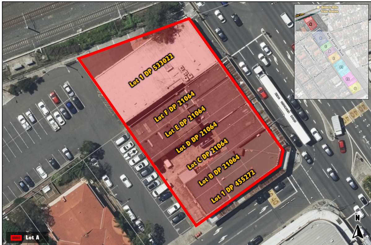
Figure 2: Group A Lots