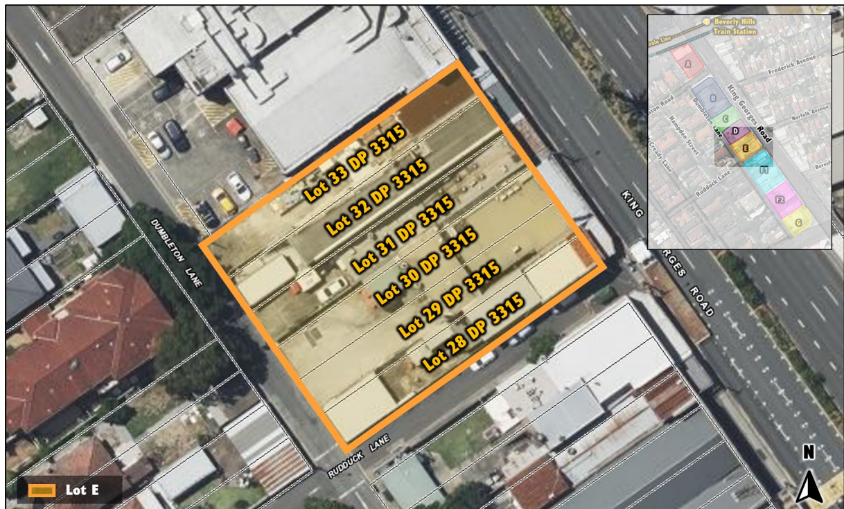
Figure 6: Group E Lots