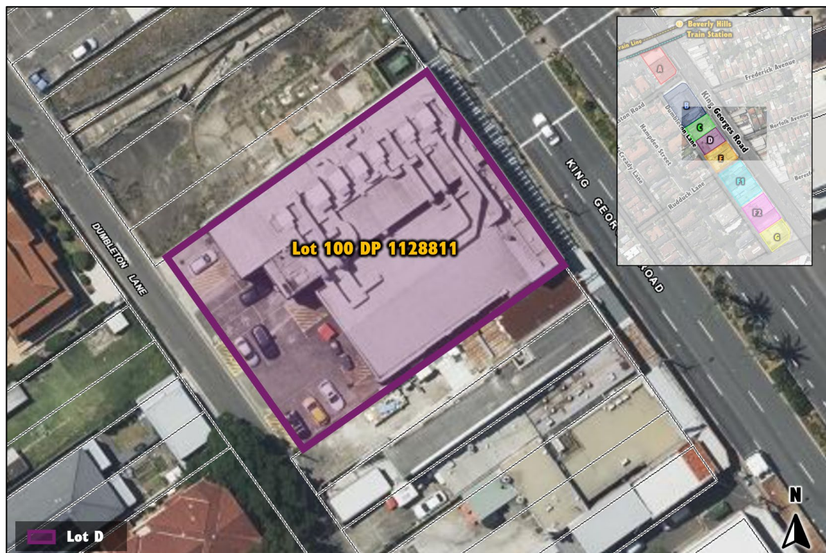
Figure 5: Group D Lots