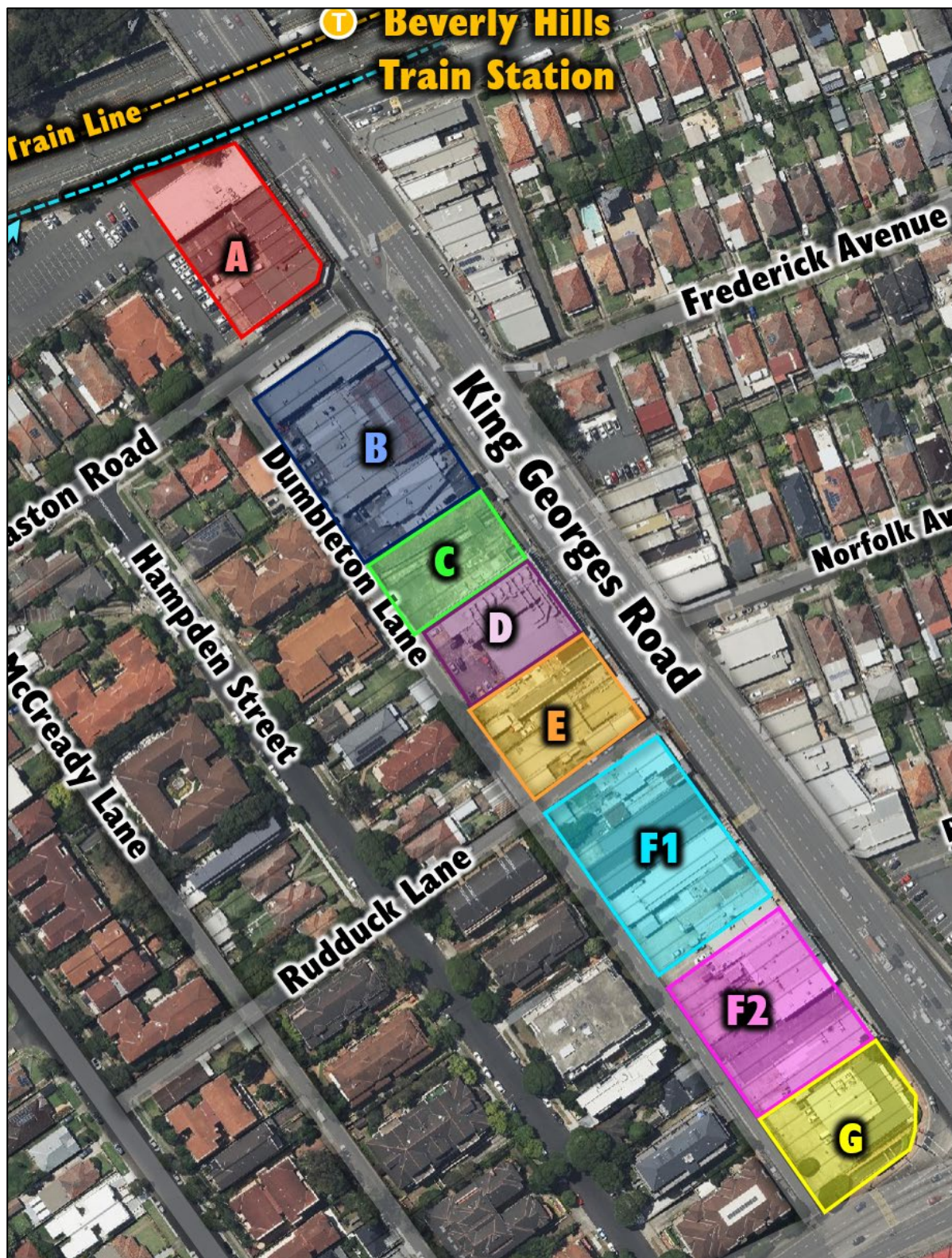
Figure 1: Subject Site – Lot Groupings