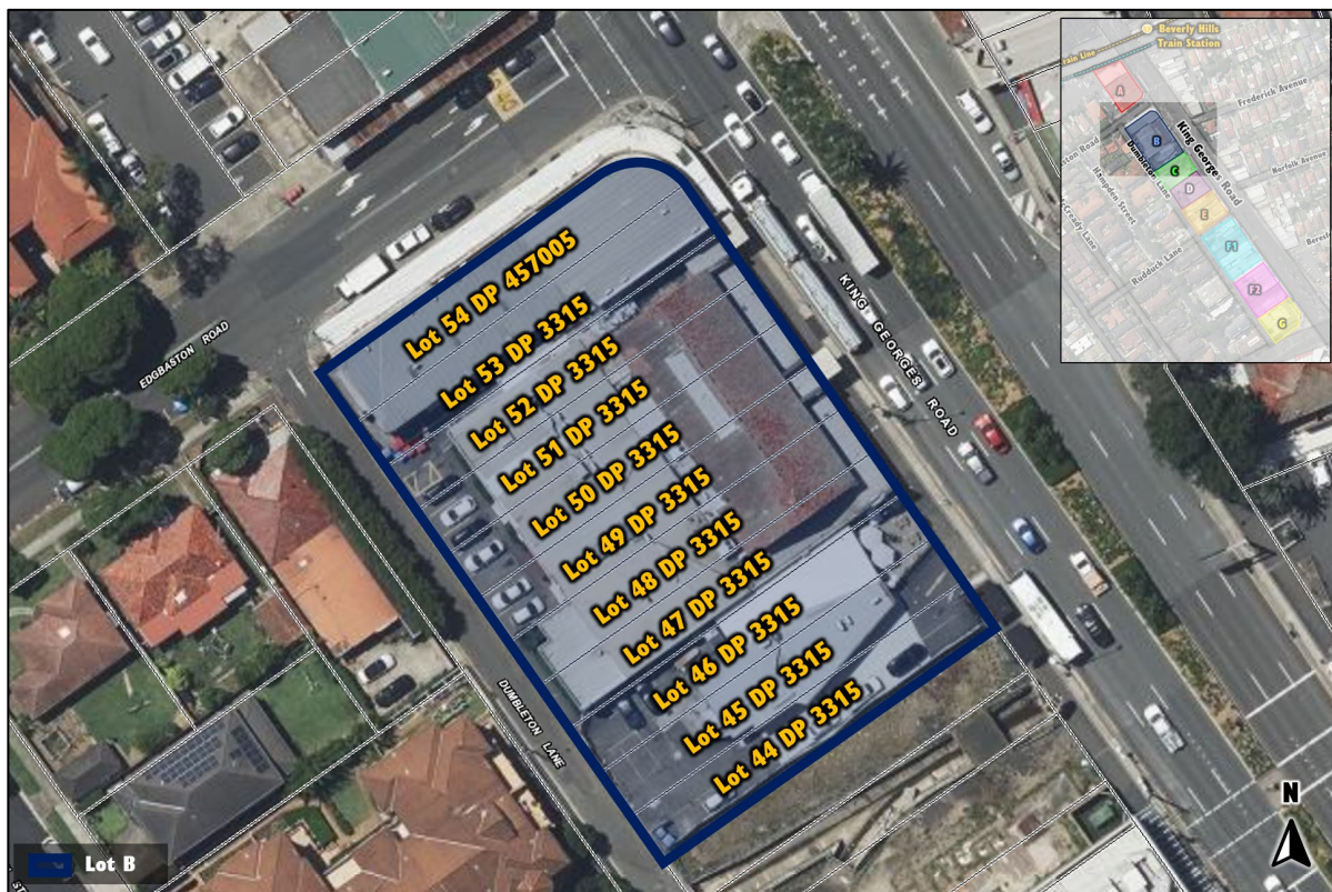
Figure 3: Group B Lots